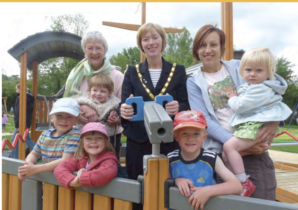
Play for all at the new Emberton Park play area (see page 3)