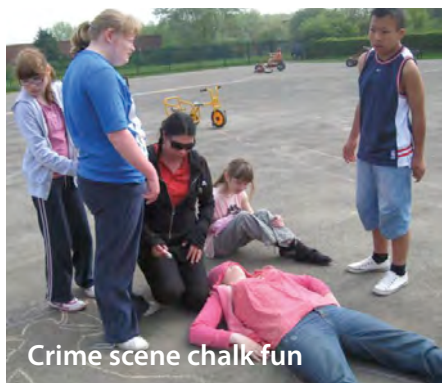
Crime scene chalk fun

The fun did not stop for the children shying from the sunshine with Easter themed crafts, cookery and a fantastic crime scene activity using chalk, initiated by the children and involving all members off staff.