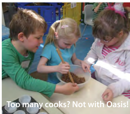
Too many cooks? Not with Oasis!

Oasis are already well into planning for the summer with activities such as outdoor cooking, National Play day activities, lots of crafts and many outdoor games and fun.